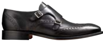
414116F Black Calf