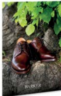
Skye Showcard A170