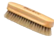
Small Horsehair Brush (packs of 12)