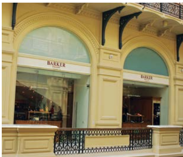
Barker GUM Shopping Mall, Red Square, Moscow