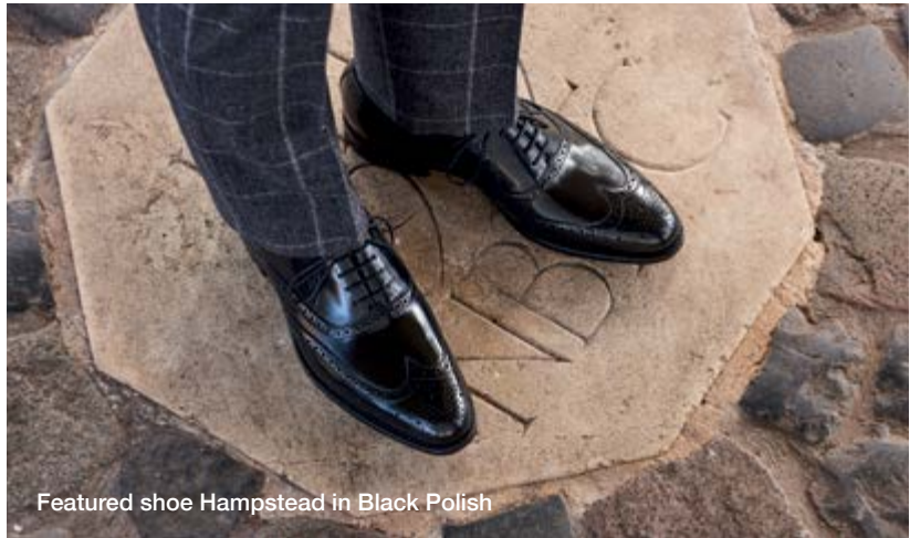
Featured shoe Hampstead in Black Polish

7mm Leather Sole Goodyear Welted Shape 469 | Size 6-12 419717G Black Polish 419747G Castagna Suede