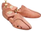
Aromatic Cedar Shoe Trees (pairs)

A06 Small 5-7 A07 Medium 7.5-8.5 A08 Large 9-10 A09 Extra Large 10.5-12