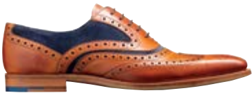
382926F Cedar Calf / Blue Suede* ©

A modern take on a classic full brogue with intricate wingtip and toe punched detail. 7mm Leather Sole, Goodyear Welted, Shape 443 | Size 6-12 *Full Sizes 13-15