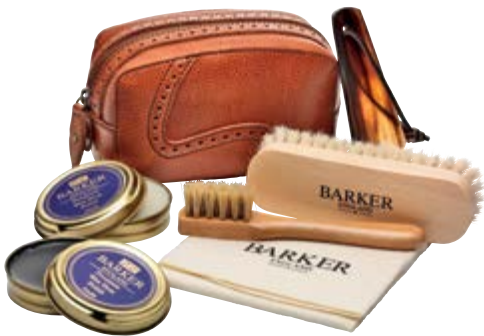
Shoe Care Kit A68