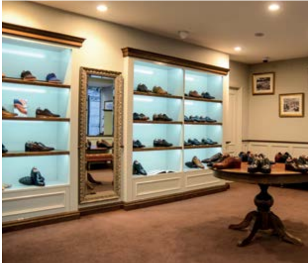
Barker Old Broad Street, London