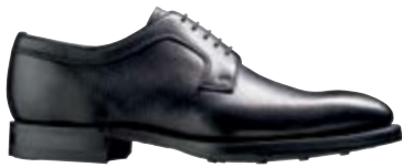
398816F Black Grain