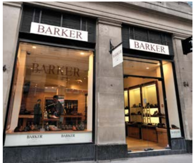
Barker Cheapside, London