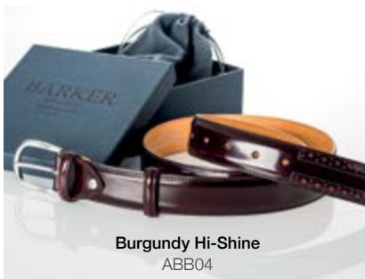
Burgundy Hi-Shine ABB04