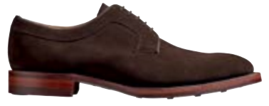
398886F Burnt Oak Suede