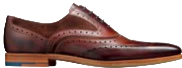
382936 Brown Calf / Snuff Suede