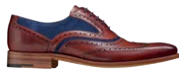
3829FW23 Rosewood / Navy Suede ©