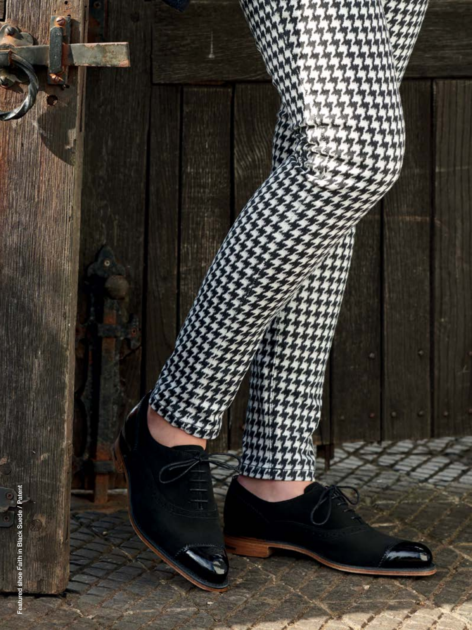
Featured shoe Faith in Black Suede / Patent