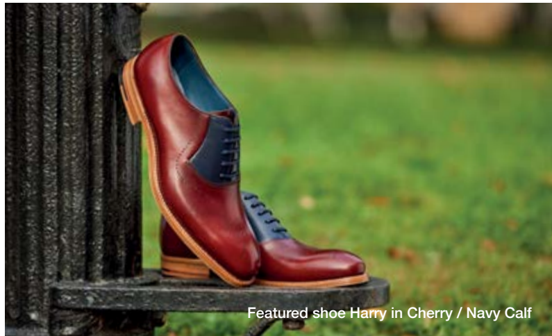
Featured shoe Harry in Cherry / Navy Calf

418126F Cedar / Rosewood Calf 418136F Walnut Calf / Brown Grain 418156F Cherry / Navy Calf