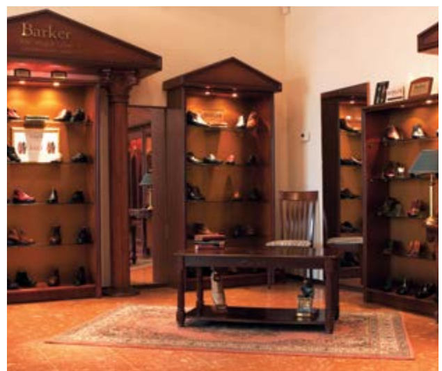
Barker Crocus City Mall, Moscow