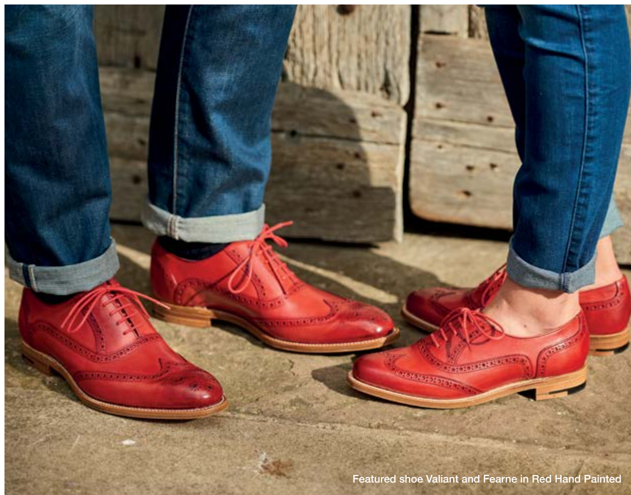
Featured shoe Valiant and Fearne in Red Hand Painted