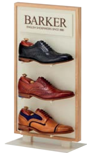
Window Display Stand A176

12 Shoe Display Stand H 156cm x W 44cm x D 25cm