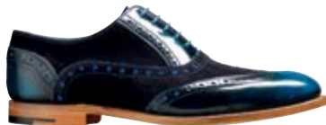
3372FW13 Classic Blue / Black / Blue Hi-Shine