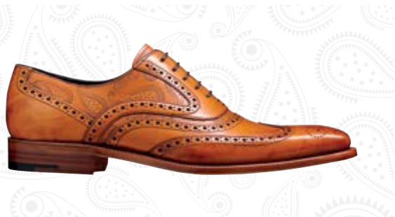
382986F Cedar Calf / Paisley Laser / Paisley Laser Sole ©