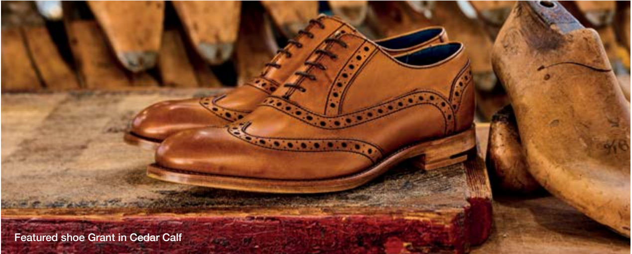
Featured shoe Grant in Cedar Calf