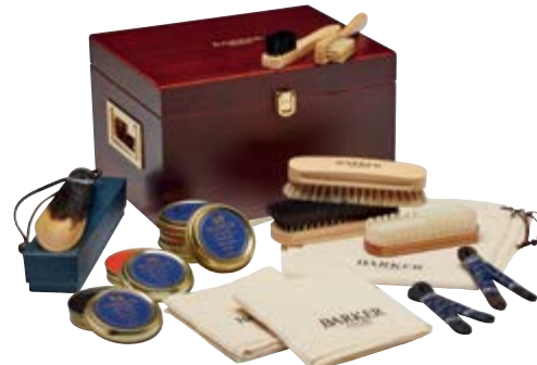
Valet Box A711