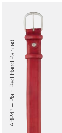
ABP43 – Plain Red Hand Painted

7mm Leather Sole Goodyear Welted Shape 446 | Size 6-12 417826F Brown Hand Painted 417836F Red Hand Painted 417846F Blue Hand Painted 417856F Navy Hand Painted 417866F Grey Hand Painted