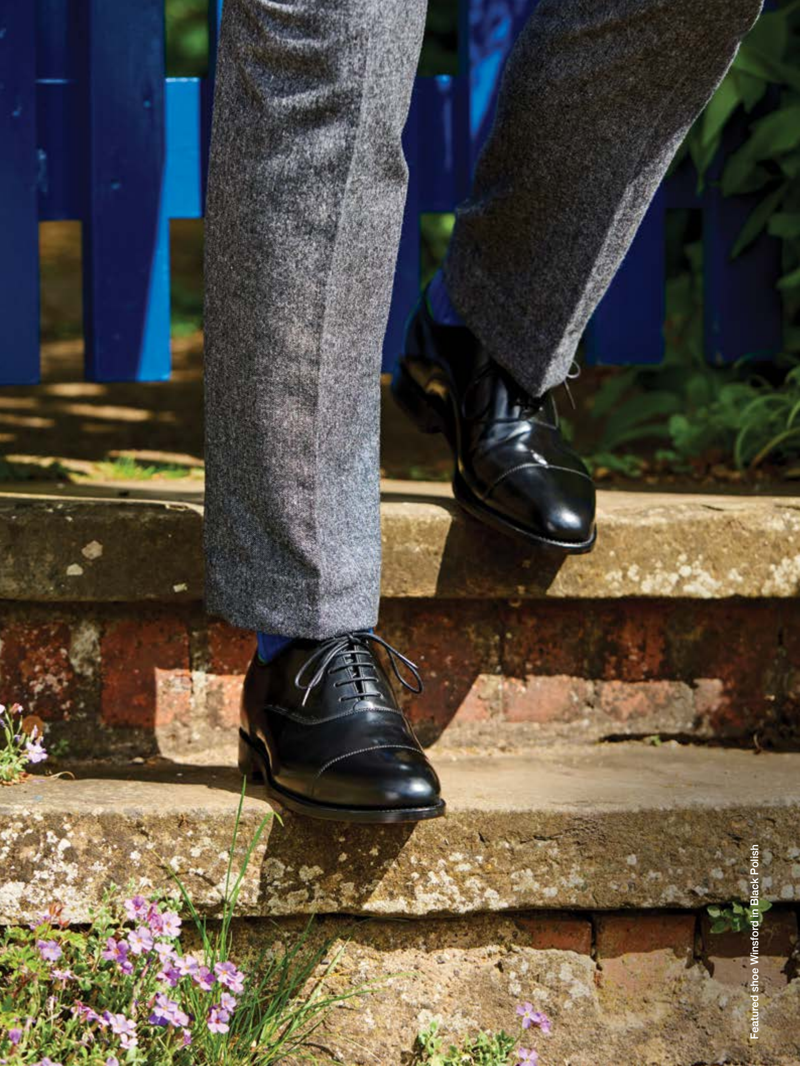
Featured shoe Winsford in Black Polish