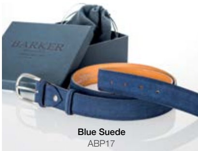
Blue Suede ABP17