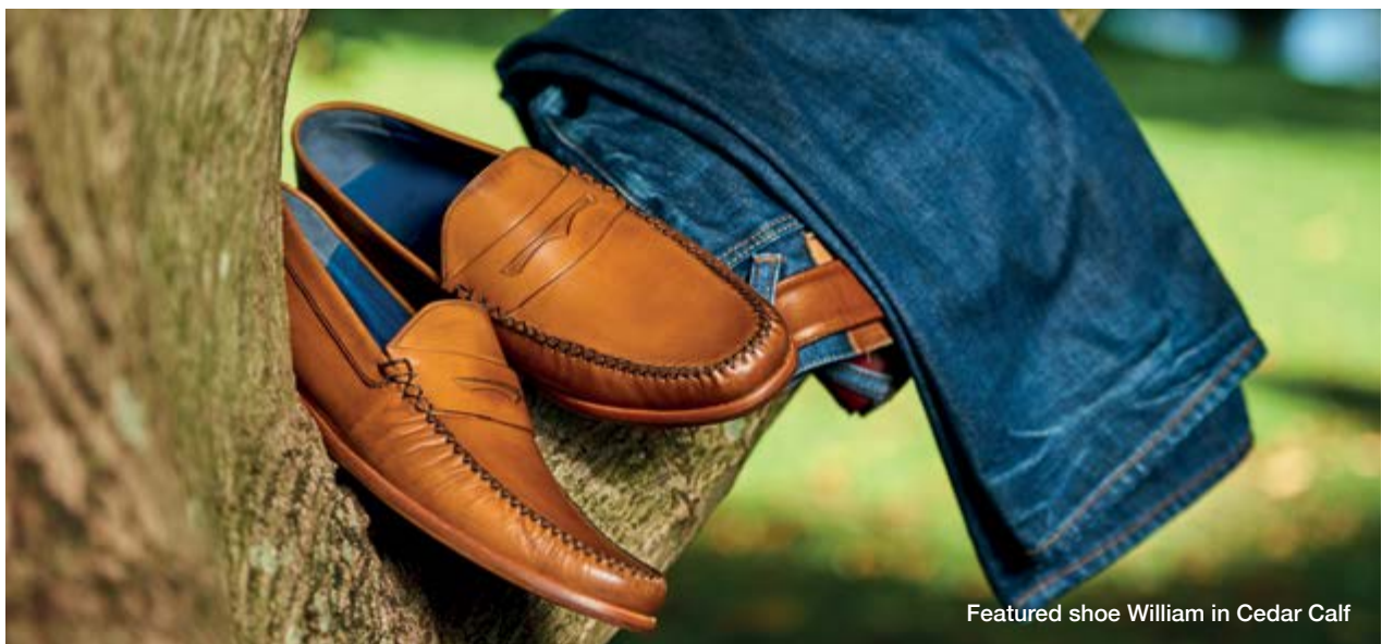
Featured shoe William in Cedar Calf

849217G Black Kid* © 849277G Burgundy / Black Kid