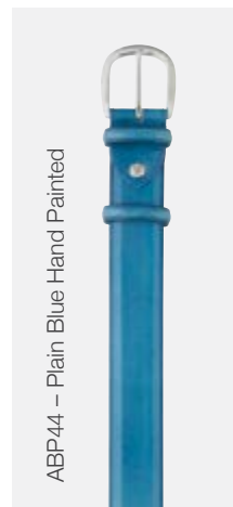
ABP44 – Plain Blue Hand Painted