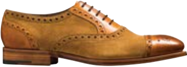
405826F Snuff Suede / Cedar Calf