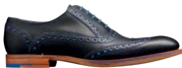
3372GR19 Navy / Classic Blue Calf ©