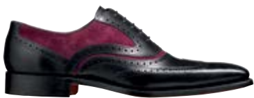
382966F Black Calf / Plum Suede