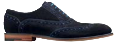
3372FW19 Navy / Blue Suede