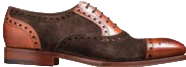
405846F Bitter Choc Suede / Rosewood Calf