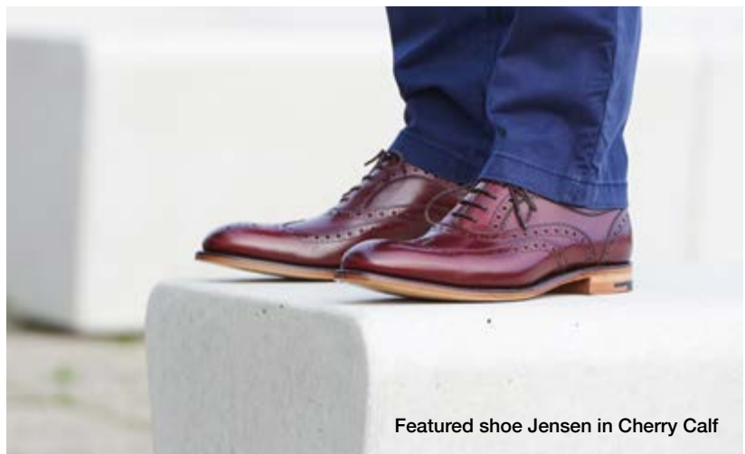
Featured shoe Jensen in Cherry Calf

404216F Black Calf 404226F Cedar Calf 404236F Cherry Calf 404256F Cedar / Blue Calf