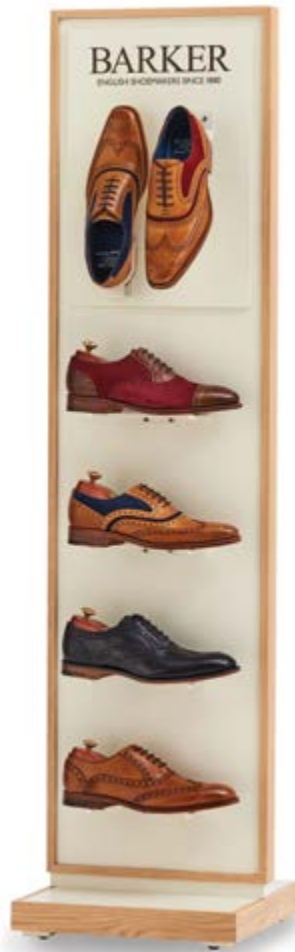
Double Sided Display Stand A175

12 Shoe Display Stand H 156cm x W 44cm x D 25cm