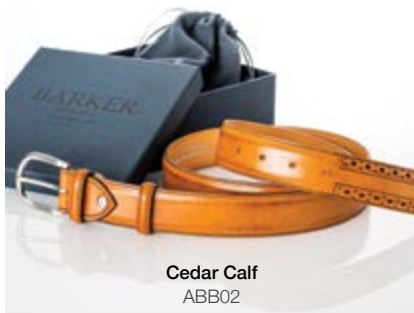
Cedar Calf ABB02