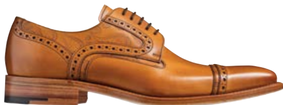
413157G Cedar Calf / Paisley Laser / Paisley Laser Sole