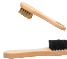
Applicator Brush (packs of 12)