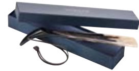
Genuine Horn Shoe Lift