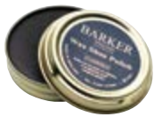
Quality Wax Shoe Polish (packs of 12)

A430 Black A431 Dark Brown A432 Burgundy A433 Tan A434 Neutral