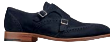
414156F Dark Navy Suede (N)