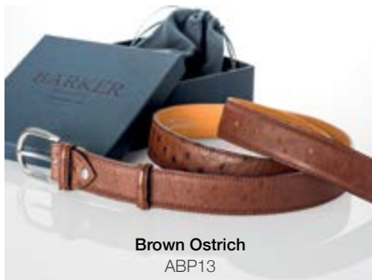
Brown Ostrich ABP13