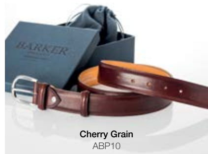
Cherry Grain ABP10