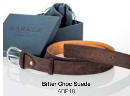
Bitter Choc Suede ABP18