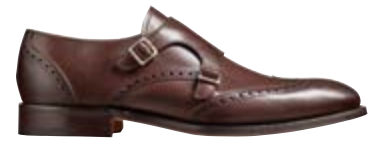
414136F Mocha Calf