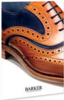
McClellan Showcard A168