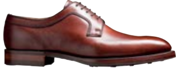
398876F Cherry Grain