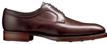
398836F Brown Grain