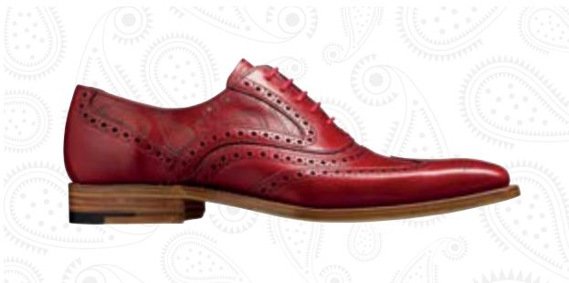
3829FW21 Red Calf / Paisley Laser / Paisley Laser Sole ©