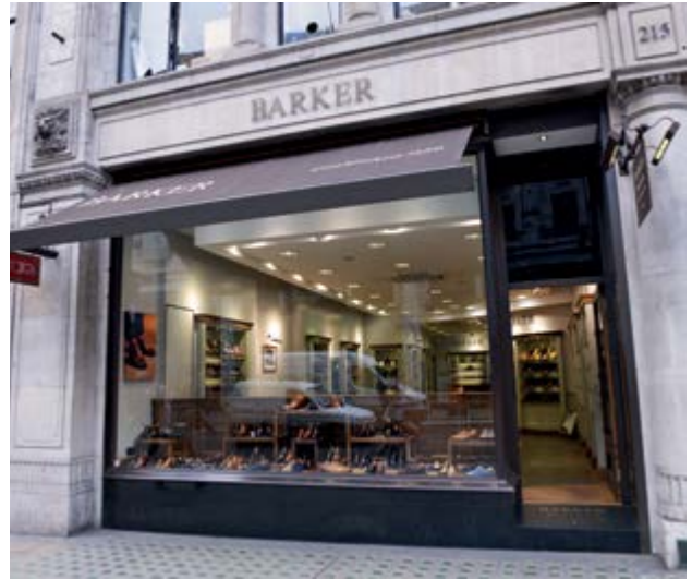
Barker Regent Street, London