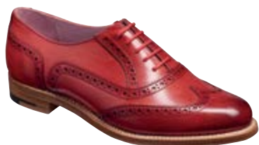
7127DW70 Red Hand Painted

Cut from high quality unfinished crust leather and hand painted with natural dyes. 6mm Leather Sole, Goodyear Welted, Shape 5023 | Size 3-8