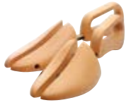
Wooden Shoe Trees (pairs)

A06 Small 5-7 A07 Medium 7.5-8.5 A08 Large 9-10 A09 Extra Large 10.5-12