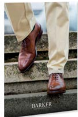
Nevis Showcard A166