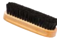
Small Horsehair Brush (packs of 12)