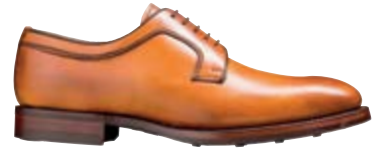
398846F Cedar Grain