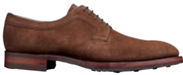
398866F Castagna Suede