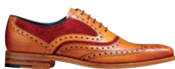
382976F Cedar Calf / Burgundy Suede ©