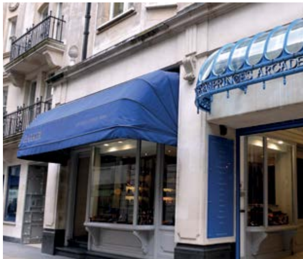
Barker Jermyn Street, London