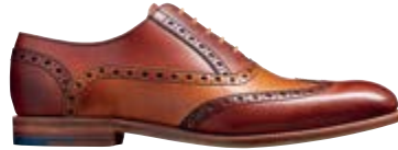
3372GW54 Rosewood Calf / Cedar Grain