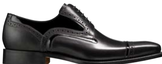
4131GW10 Black Calf / Black Patent