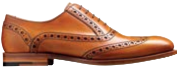
337226F Cedar Calf* ©

A modern twist on a traditional full brogue crafted on our 446 last. A large selection of colours available. 7mm Leather Sole, Goodyear Welted, Shape 446 | Size 6-12 *Full sizes 13-15