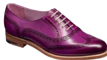
7127DW72 Purple Hand Painted