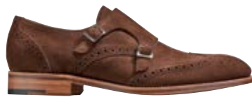
414126F Castagna Suede (N)