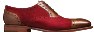
405876F Burgundy Suede / Walnut Calf