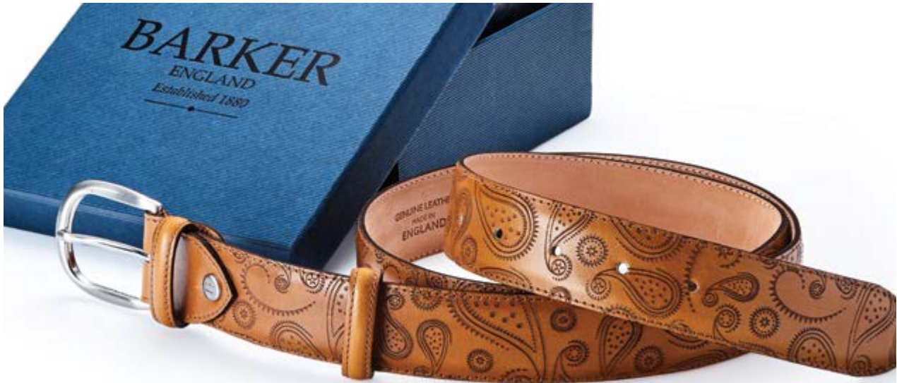
Cedar Paisley Laser ABP25