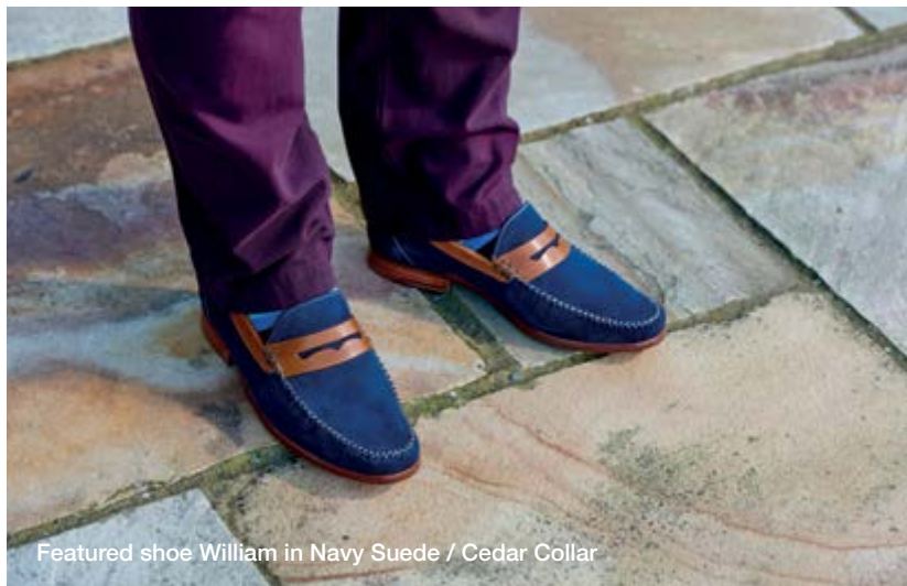
Featured shoe William in Navy Suede / Cedar Collar

6mm Leather Sole Lockstitch Shape 465 | Size 6–12 394407G Black Calf 394467G Cedar Calf 394477G Navy Suede / Cedar Collar 394487G Bitter Choc Suede (N) 394497G Dark Navy Suede (N)