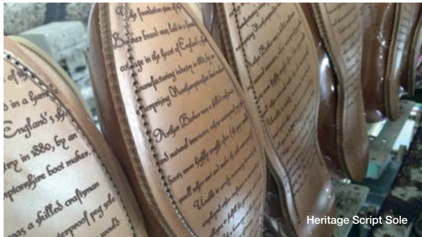
Heritage Script Sole

392737G Rosewood Calf 392747G Mocha Calf