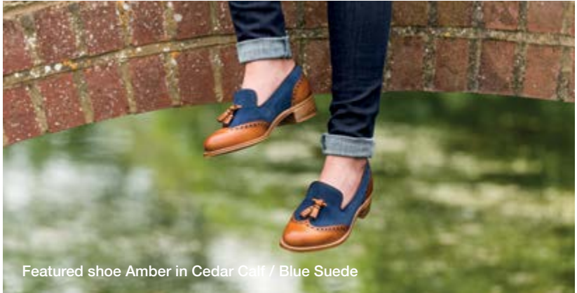
Featured shoe Amber in Cedar Calf / Blue Suede

6mm Leather Sole Goodyear Welted Shape 5024 | Size 3-8 717826D Cedar Calf / Blue Suede