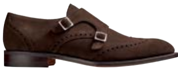
414146F Burnt Oak Suede