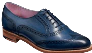
7127DW71 Navy Hand Painted