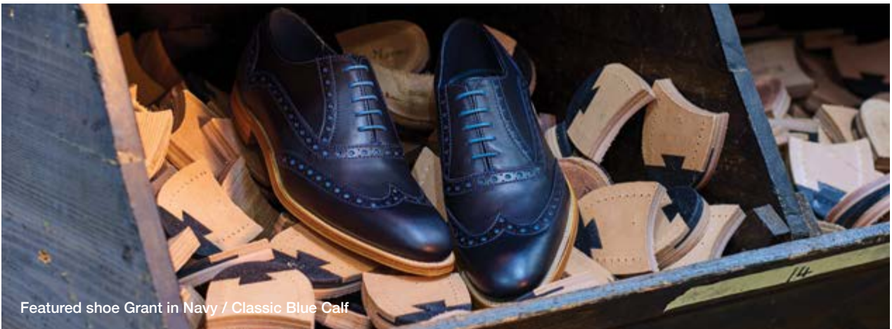
Featured shoe Grant in Navy / Classic Blue Calf