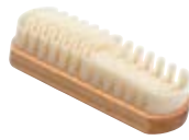
Suede / Nubuck Cleaner (packs of 12)

A440 Black A441 Tan A442 Brown A443 Burgundy A444 Neutral