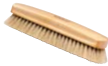
Large Horsehair Brush (packs of 12)