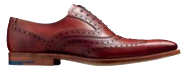
382946F Rosewood Calf