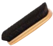
Large Horsehair Brush (packs of 12)