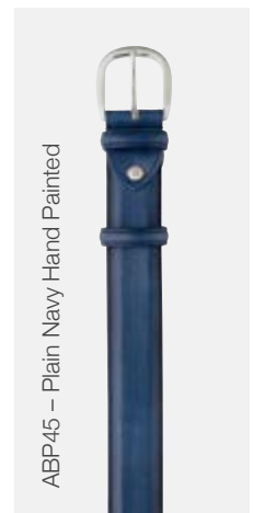
ABP45 – Plain Navy Hand Painted