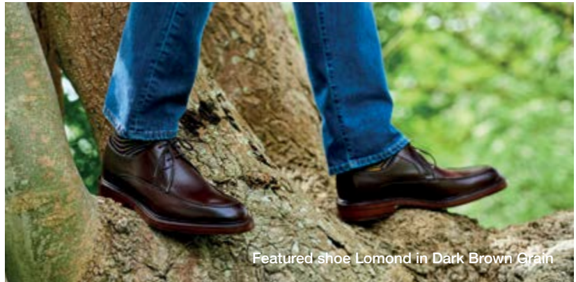
Featured shoe Lomond in Dark Brown Grain

10mm Dainite Sole Goodyear Welted Shape 460 | Size 6–12 412536F Dark Brown Grain 412576F Cherry Grain