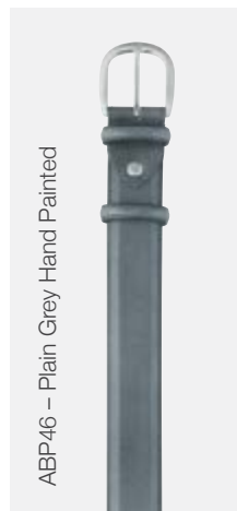
ABP46 – Plain Grey Hand Painted