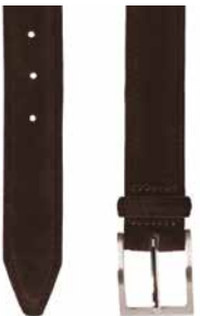
WILLIAM Dark Brown Suede