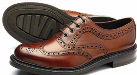
1880 Country EDWARD ( New Colour )

Hand Painted Dark Brown Calf & Black Calf