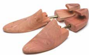
CEDAR SHOE TREE

Cedar Shoe Tree: Made in aromatic Cedar in UK sizes: 5, 6, 7, 8, 9, 10, 11 and 12/13 to protect your shoes and help them to maintain their shape after wear.