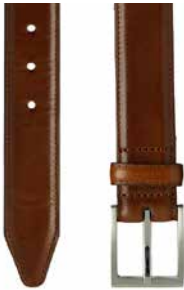
PHILIP Cedar Calf