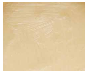
OILED LEATHER WAX