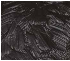
SAPHIR CREAM Black (B)