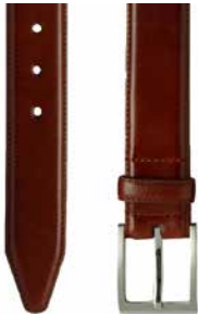
PHILIP Mahogany Calf