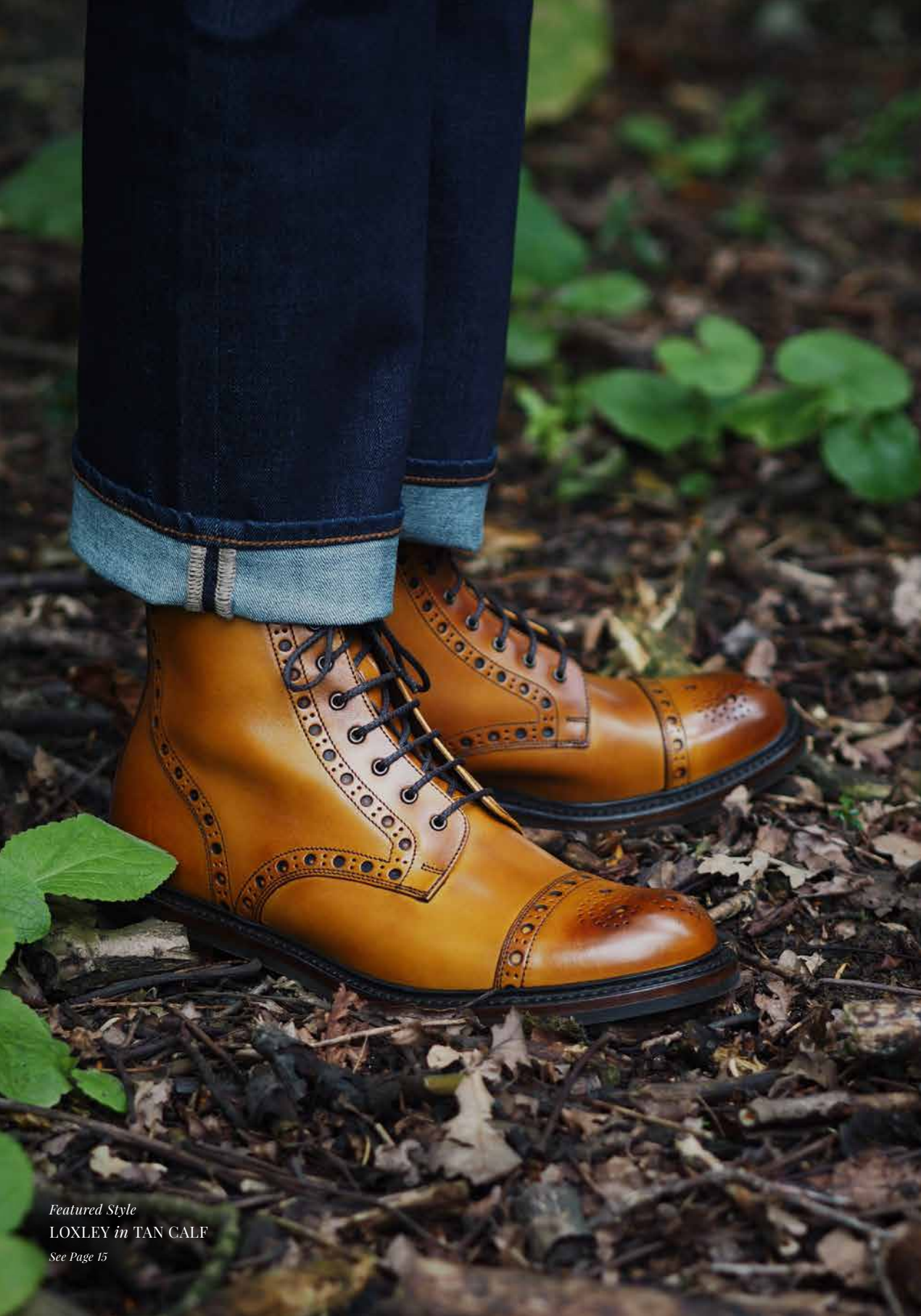
Featured Style LOXLEY in TAN CALF See Page 15