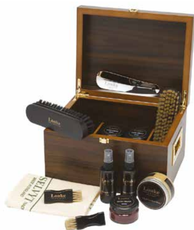
LUXURY VALET BOX

2x Small applicator brushes and 2x Large polishing brushes.