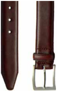
PHILIP Burgundy Calf