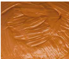
SAPHIR CREAM Tan (T)