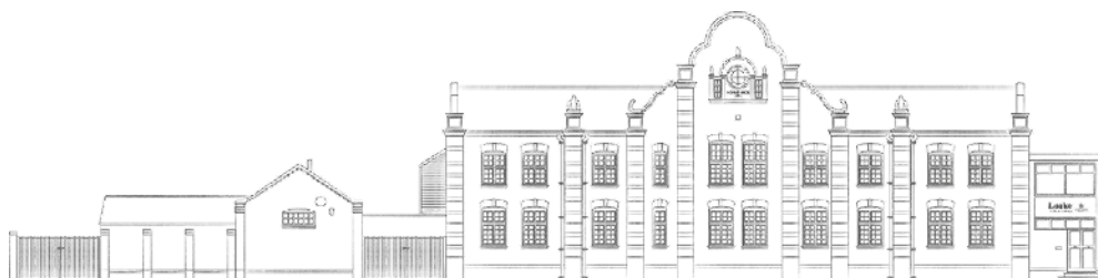
Unique Boot Works