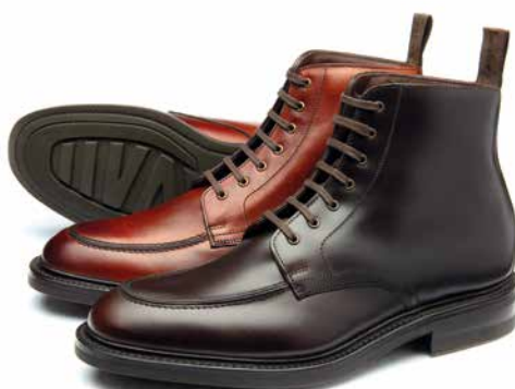
1880 Country GISBOURNE ( New Style )

Goodyear Welted Victory Rubber Soles, Fully Leather Lined, Leather Insoles, Last O24, F Fitting Sizes 7 to 11 inc half sizes & 12