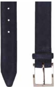
WILLIAM Navy Suede