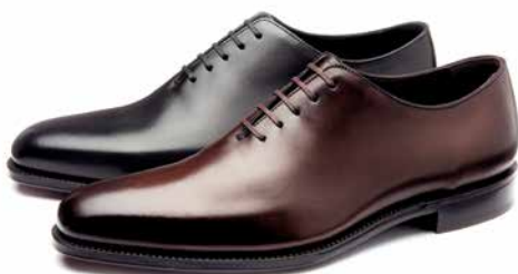
1880 Classic WHOLEBURY ( New Style )

Goodyear Welted Leather Soles, Fully Leather Lined, Leather Insoles, Last River, F Fitting Sizes 7 to 11 inc half sizes