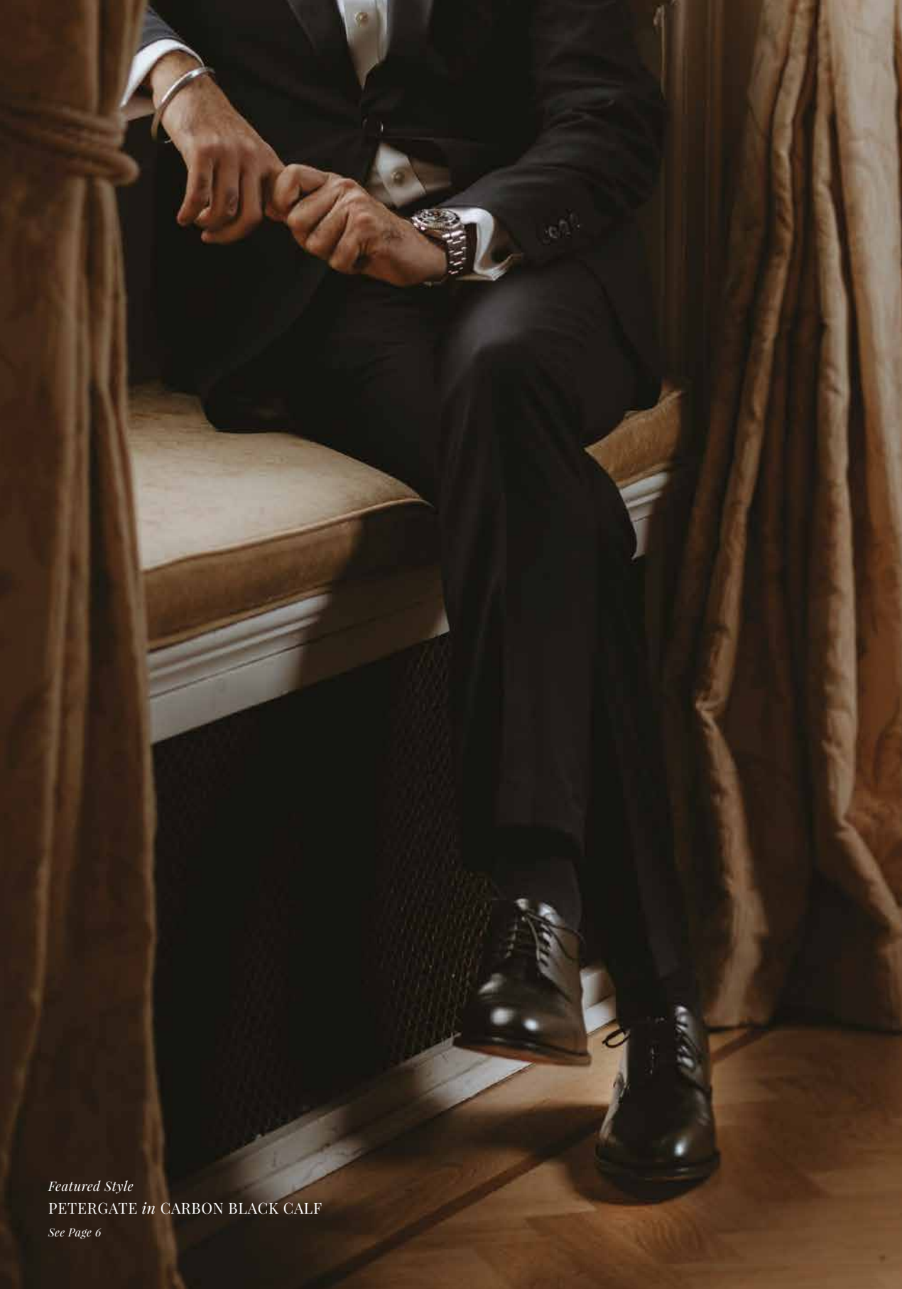
Featured Style PETERGATE in CARBON BLACK CALF See Page 6