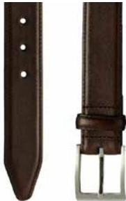
PHILIP Dark Brown Calf