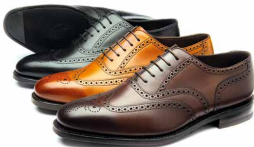
1880 Classic BUCKINGHAM ( New 'G' Fitting )

Goodyear Welted Shadow Rubber Soles, Fully Leather Lined, Leather Insoles, Last Capital, G Fitting Sizes 6 to 11 inc half sizes & 12