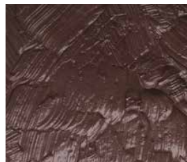
SAPHIR CREAM Dark Brown (DK)