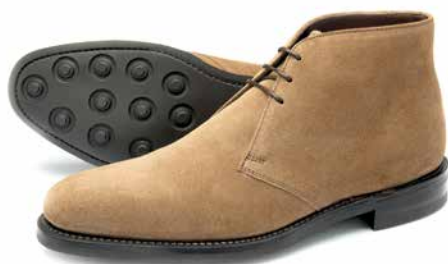
1880 Classic PIMLICO ( New Colour )

Hand Painted Dark Brown Calf, Hand Painted Tan Calf & Black Calf