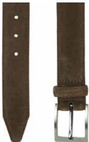
WILLIAM Flint Suede

Please note: Our Philip belts are handmade in India and have been developed to match the same burnished colour and characters of our calf leathers. Our William suede belts are also handmade in India using the same suede as all of our suede leather shoes. Due to the nature of our belt production, you will need to add two inches to your trouser waist size when selecting your belt size.