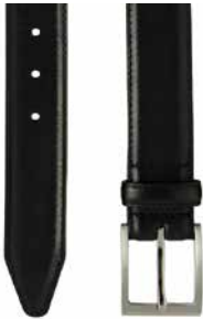
PHILIP Black Calf