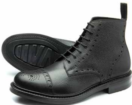
1880 Country LOXLEY ( New Colour )

Goodyear Welted Victory Rubber Soles, Fully Leather Lined, Leather Insoles, Last Pennine, G Fitting Sizes 7 to 11 inc half sizes