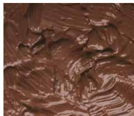
SAPHIR CREAM Brown (CH)