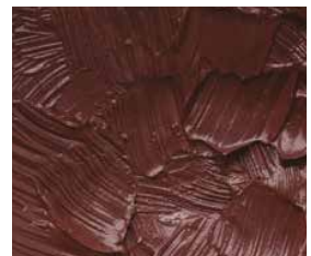
SAPHIR CREAM Mahogany/Conker (MC)