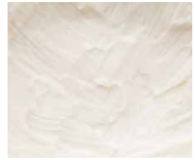
SAPHIR CREAM Neutral (NE)