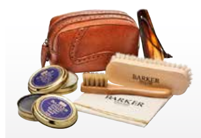
Shoe Care Kit A68