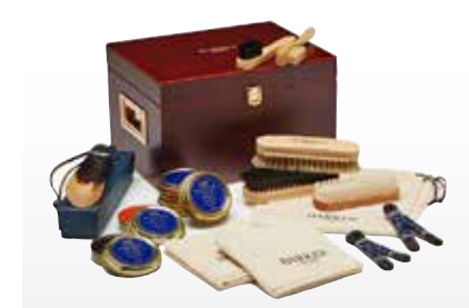
Valet Box A711