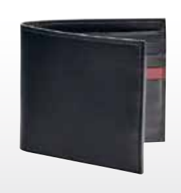
A3132 Black Calf with Red Strip