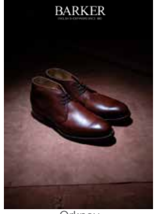
Orkney A265 | Size A4