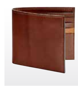
A3133 Dark Walnut Calf with Cedar Strip