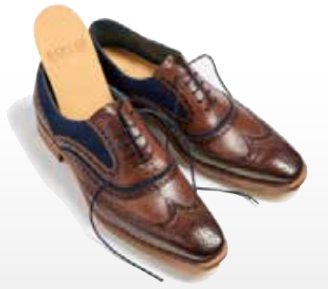
Insoles (single pairs) Mens AL104S Ladies AL105S