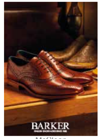
McClean A903 | Size A5