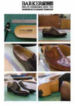
BarkerTech A901A | Size A4