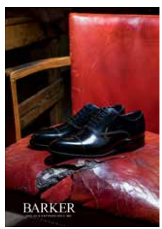
Winsford A264 | Size A4