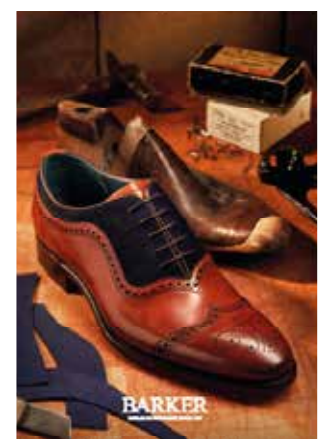
Nicholas A904 | Size A4